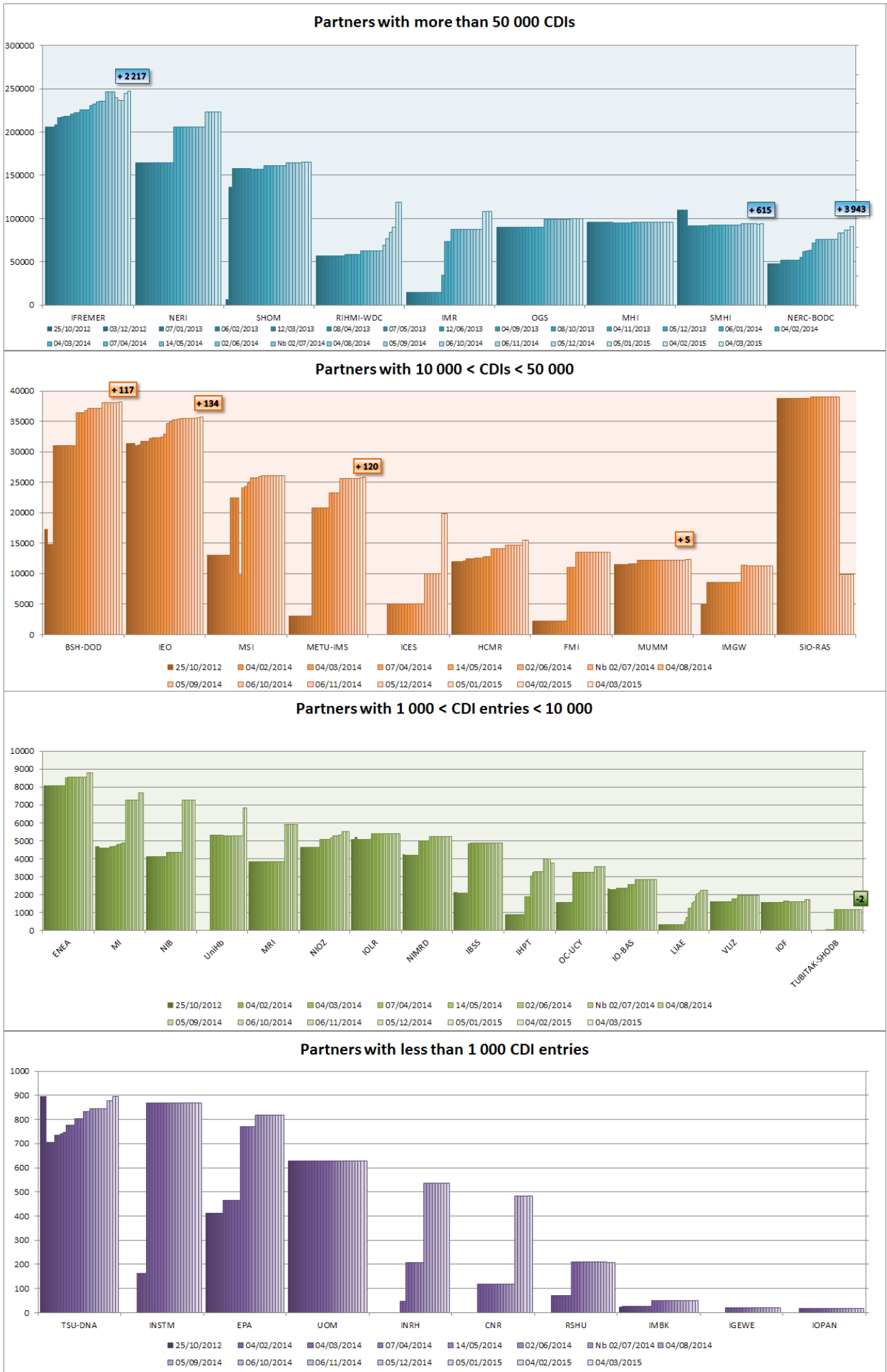
Figure 4 - Nb of CDIs per partner, data centres with new data input in February 2015